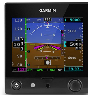
Garmin's new G5 Stand-by Instrument