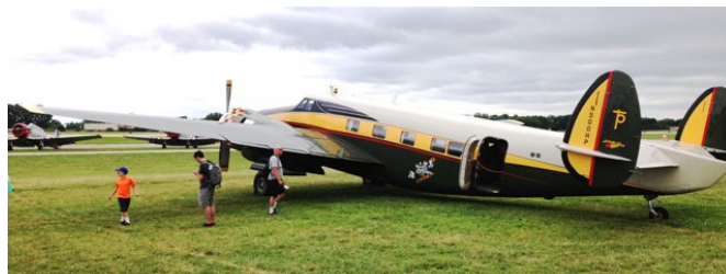
Howard 500 (at Vintage)