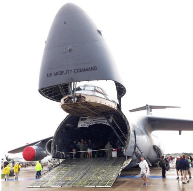
Lockheed USAF C-5 Galaxy (at the Main Plaza)