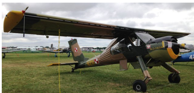
Polish PZL-104 Wilga STOL (at Warbirds)