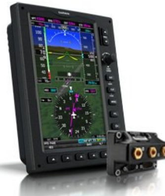
Garmin G3X for Experimentals

We will have a representative from Garmin talk about the latest products for certified and experimental aircraft, ADS-B compliance, Garmin Portables and Apps, and answer any questions you may have. Anyone interested in Aviation is always welcomed to attend.