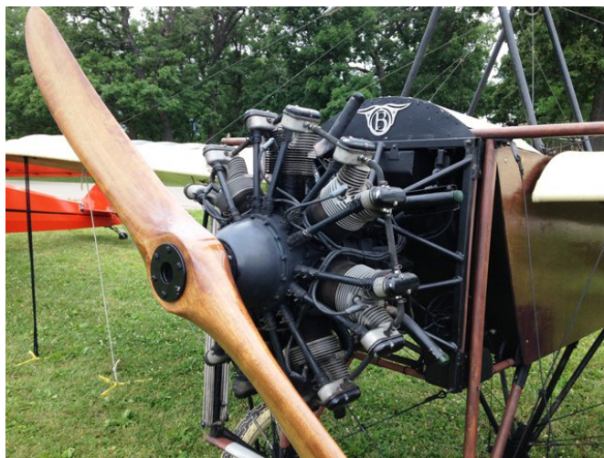
Flying replica of the Blériot XI Monoplane (at Vintage)