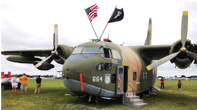
Fairchild C-123K Provider (at Warbirds)