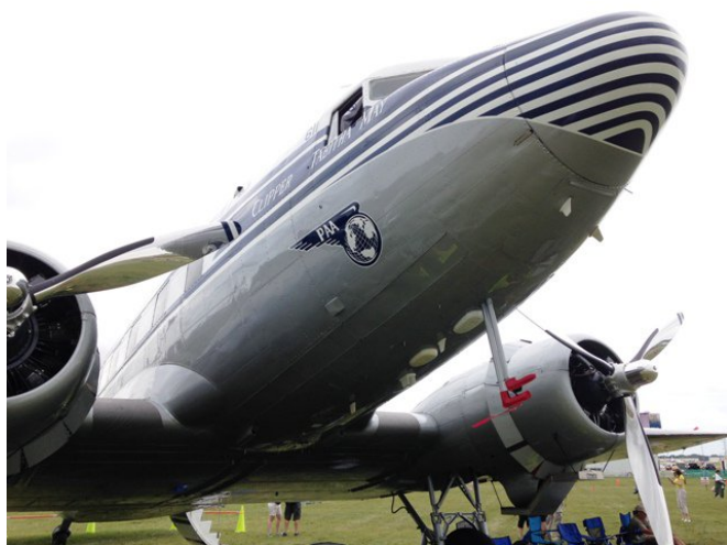
DC-3 in Pan American Airways Livery (at Vintage)