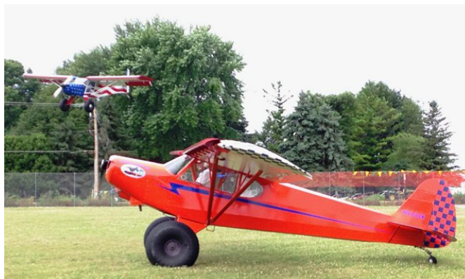
Valdez STOL Demo (at Ultralight Field)

EAA HQ held its yearly Aviation Convention on July 25-31.