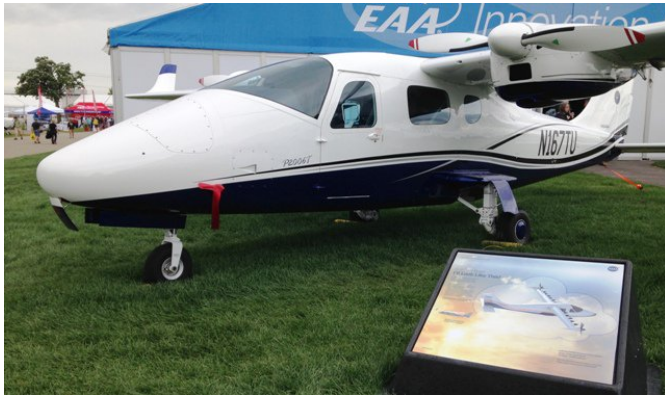
NASA Research Tecnam P2006T to be converted to electric (at the NASA Pavilion)