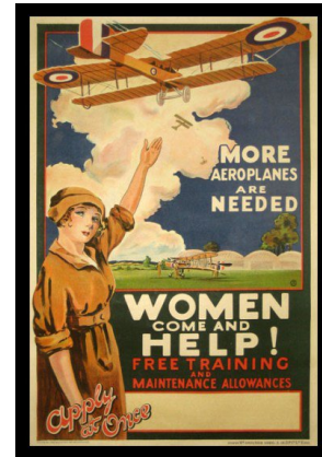
Women have been building, flying, and fixing aircraft since the Dawn of Aviation (WWI British Poster)