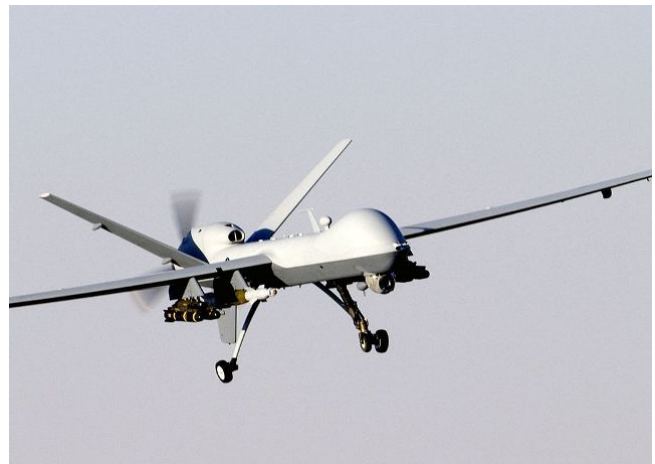
MQ-9 Reaper in flight

There will be a presentation on Drones and how they affect GA aircraft flying and regulations.