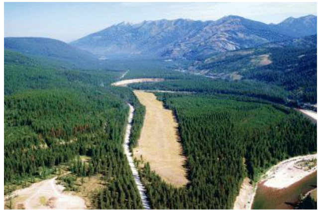
Spotted Bear Airport (8U4), Montana

We will have a representative from this organization talk about their efforts to save old, maintain, and build new airstrips in or near recreational areas of the US.